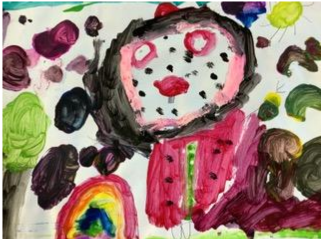
Artwork by Skyla

NB. It is very important you notify the school if your child is absent. We are required by the Ministry of Education to note down a reason for any absences and it is also important for us to know if your child is unwell. A simple phone call, email or facebook message will suffice.