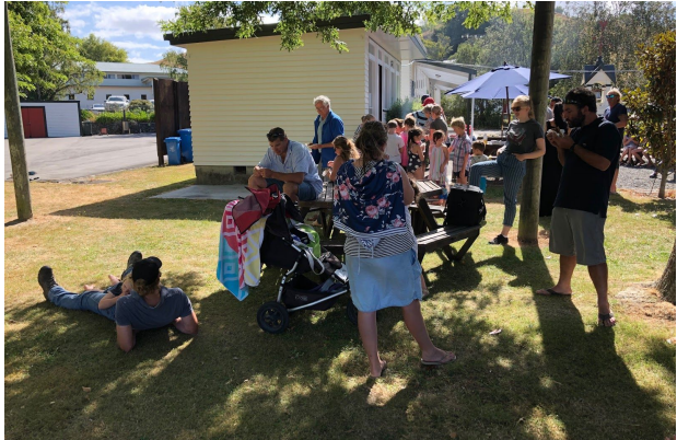
Whānau Afternoon Pics