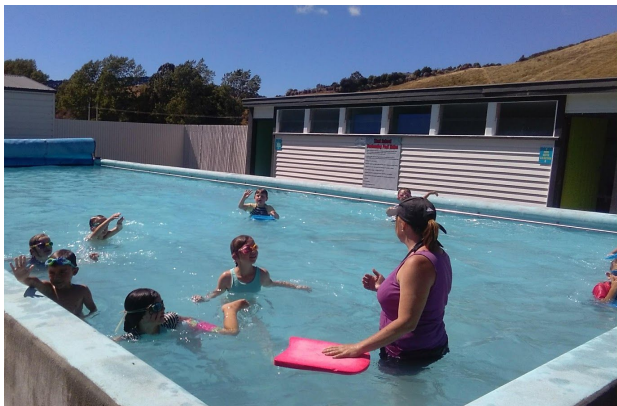
Room 3 Swimming!