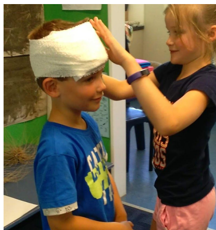
St Johns First Aid on Wednesday.