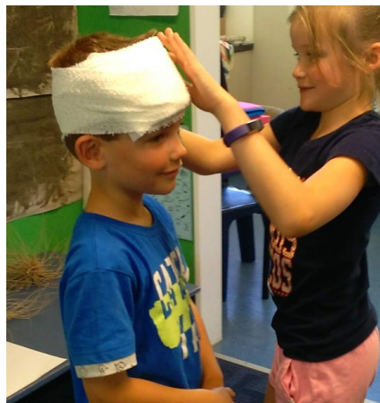
St Johns First Aid on Wednesday.