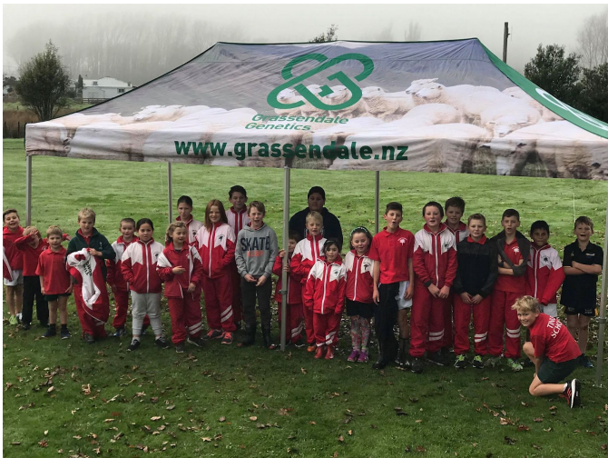
Some of our Tinui Crew on Cross Country Day

Thank you to the Mitchells who once again opened up their property so Tinui kids could practice and kids from our rural cluster could run in our Rural Schools cross country. We get so much positive feedback about our course being a "REAL" cross country course with challenging hills.