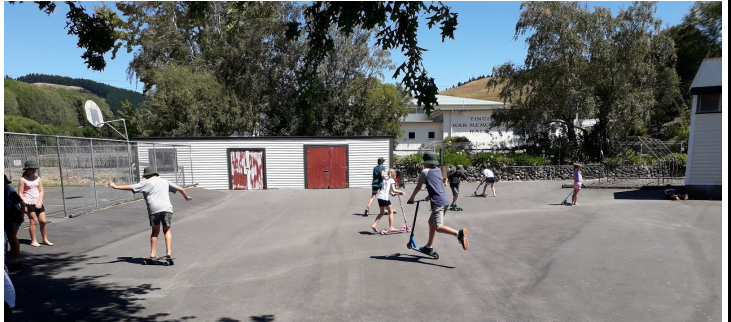
Fun in the wheels area at school which is the black top seal between the courts and Room 2