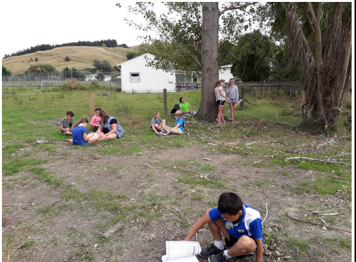
Room 4 students working on a design for the redevelopment of the area behind the pool as a wetland.