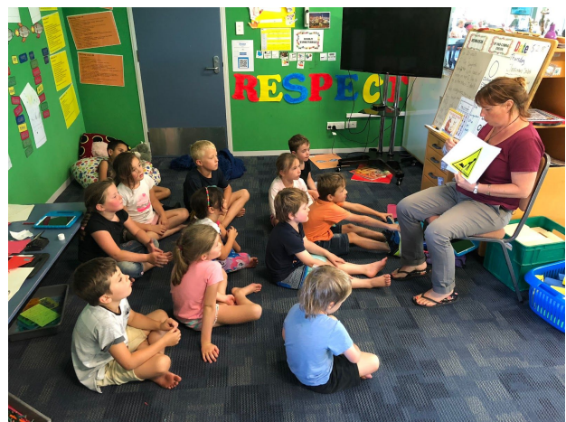
Ms Broderick setting up the expectations for work in progress in Room 3.