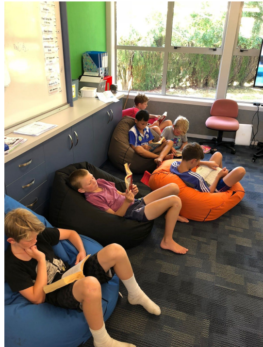
Room 4 silent reading after lunch. This gives the students a chance to wind down after being in the playground.